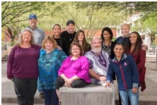
UA RISE Health and Wellness Center