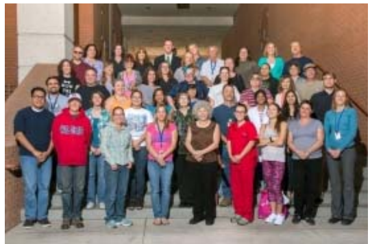
University Animal Care